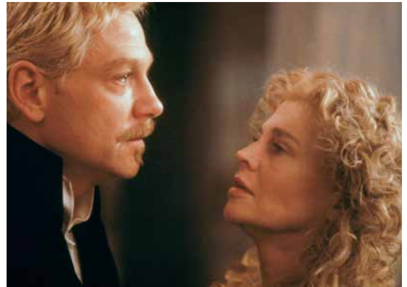
Kenneth Branagh and Julie Christie in Hamlet (1996).

In a fundamental way, Branagh's films led the charge in the revival of Shakespeare on screen. In fact, Henry V initiated a surge of Shakespeare films in the 1990s, including Baz Luhrmann's exuberantly filmed Romeo and Juliet of 1996.