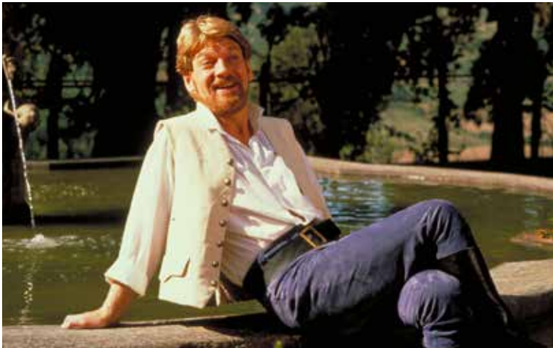
Kenneth Branagh in Much Ado About Nothing (1993).

With a budget of £5.6 million, Much Ado was shot over seven weeks in 1992 on location in Tuscany. Branagh not only directed and acted in the film but also adapted Shakespeare's text into a screenplay, editing and re-ordering the play to reduce the running time and make the story as accessible as possible. He also assembled an international cast, including Keanu Reeves and Denzel Washington that helped make Much Ado a truly popular film and Shakespeare globally marketable. As ever, the emphasis was on a naturalistic style of acting, with the American actors speaking in their own accents. Astonishingly, the film earned over $22.5 million at the American box office when it opened in 1993 and made over $30 million worldwide.