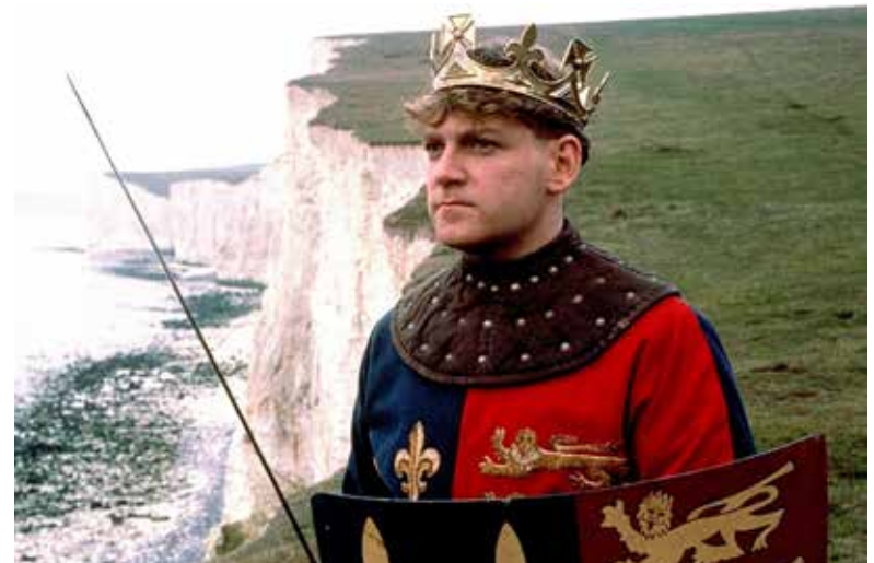
Kenneth Branagh in Henry V (1989).