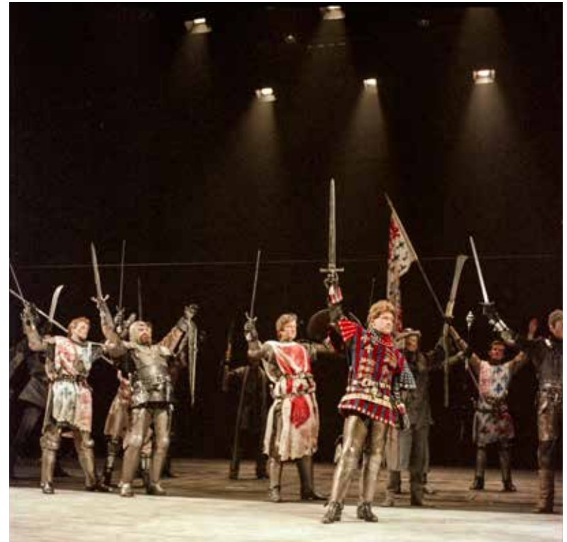
Kenneth Branagh in Henry V (1984).

A desire to make the play accessible to a wide audience meant that importance was placed on naturalistic acting, clear delivery of the Shakespearean verse, a short running time and strong visual imagery. Box office figures were testimony to the film's wide popularity. Henry V also won critical acclaim, particularly in the U.S. In fact, Branagh was nominated for both Best Actor and Best Director at the 1990 Academy Awards. Importantly, in earning success with Henry V , Branagh reinvigorated Shakespeare on screen and proved that the Bard's work could be genuinely popular with a mass audience.