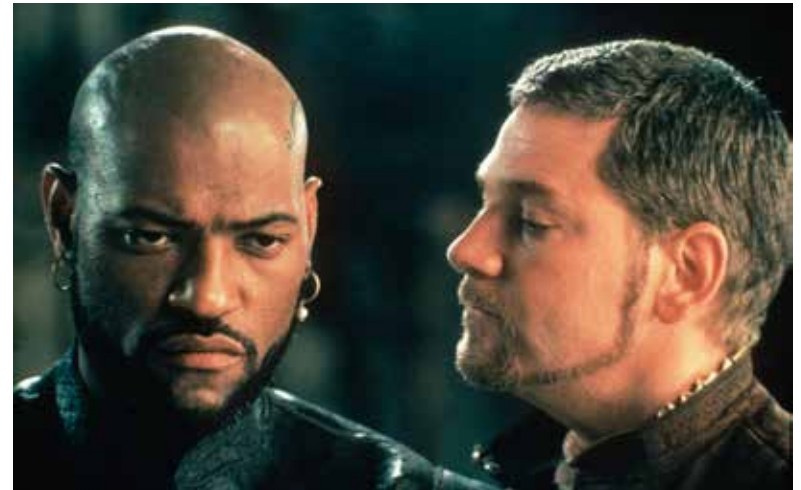
Laurence Fishburne and Kenneth Branagh in Othello (1995).

Branagh's 1996 film of Hamlet was truly epic in scale. With a budget of $18 million, it featured large sumptuous sets, the use of Blenheim Palace for exterior shots and a starry cast from both sides of the Atlantic, including Derek Jacobi, Julie Christie, Charlton Heston and Billy Crystal. Significantly, Branagh's Hamlet was also the first film of the Shakespearean tragedy to utilise a full version of the play. With a running time of over four hours, the film was radical for both Shakespeare on screen and cinema in general. Branagh wrote the screenplay,