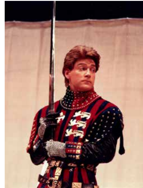
Kenneth Branagh in Henry V (1984).