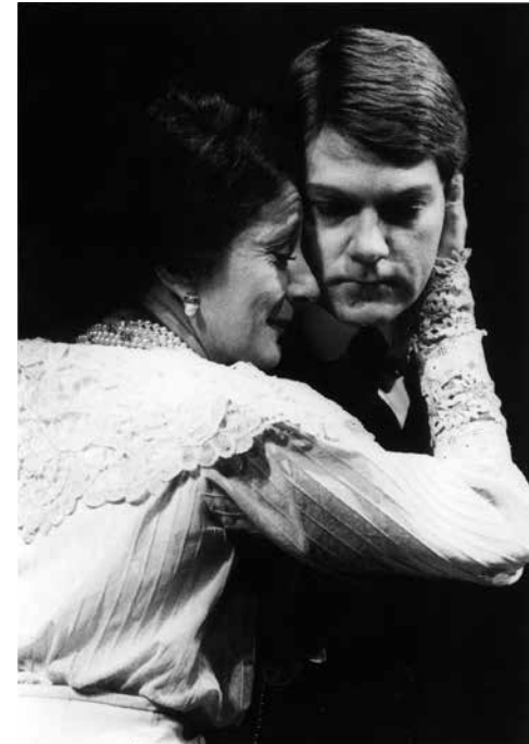
Jane Lapotaire and Kenneth Branagh in Hamlet (1992). TBC