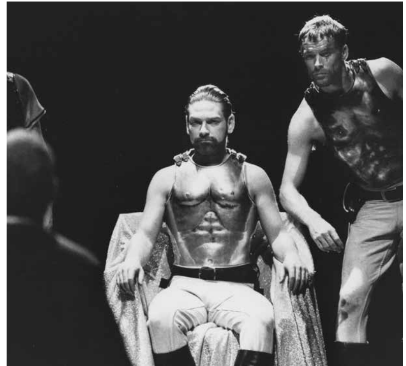
Production photograph, Coriolanus (1992) at Chichester Festival Theatre, Kenneth Branagh as Caius Martius and Iain Glen as Tullus Aufidius.

Branagh cemented the company's relationship with Shakespeare – and his own association with the Bard - by following Twelfth Night with a touring Shakespeare season, beginning in March 1988, titled Renaissance Shakespeare on the Road. The season featured three Shakespeare plays, each directed by an esteemed actor making his or her directorial debut. Much Ado About Nothing , directed by Judi Dench, featured Branagh as Benedick. As You Like It was directed by Geraldine McEwan, with Branagh as the comedic Touchstone. Finally, Derek Jacobi directed Hamlet with Branagh in the leading role. The national reach of the touring season and the use of actors as directors fulfilled two of the key principles of the company. After a three month run at Birmingham Repertory Studio, the touring season travelled to venues across the U.K. and Ireland, beginning with the Grand Opera House in Branagh's home town of Belfast. The tour also included a two week run in Denmark, at Kronberg Castle at Elsinore,