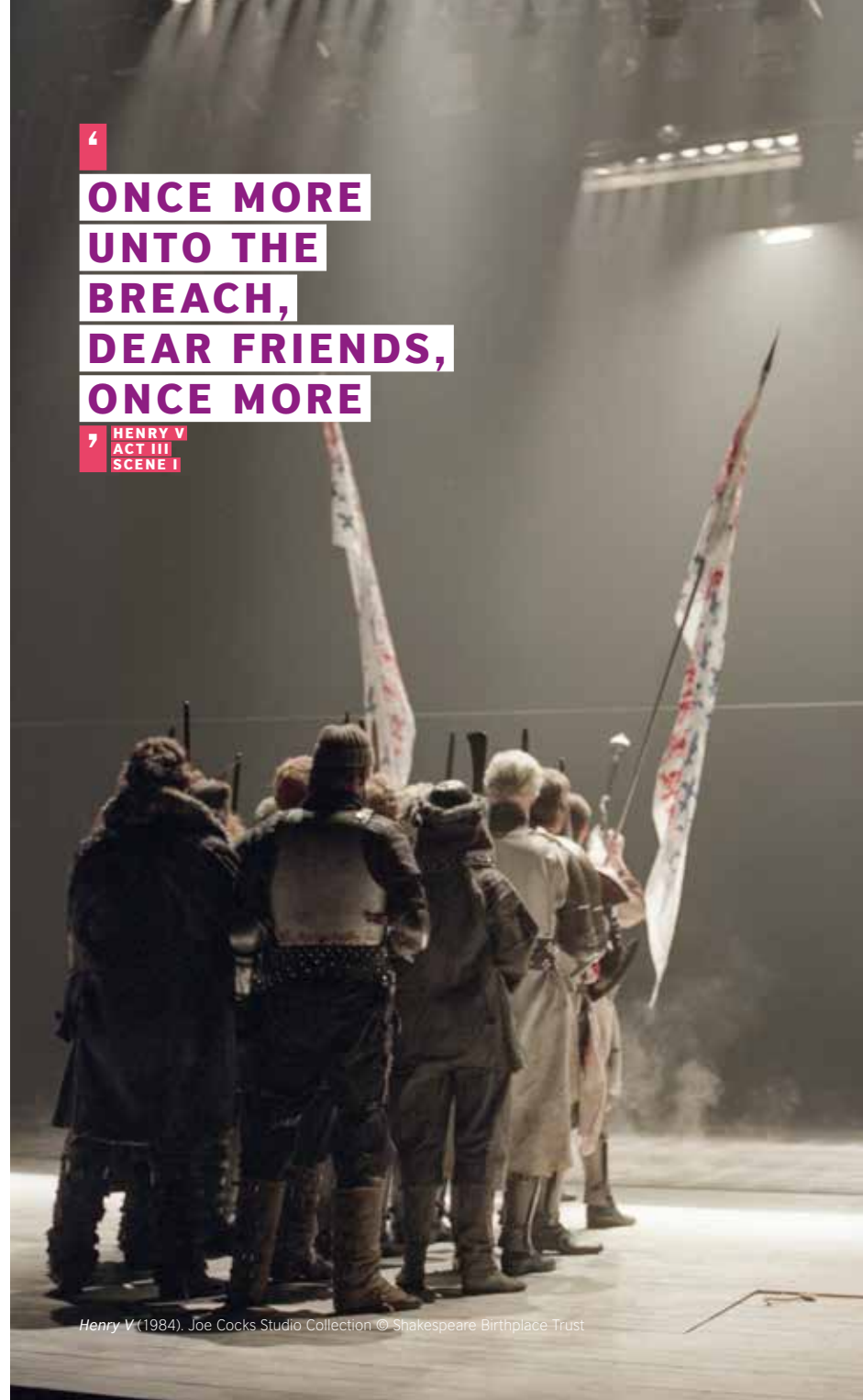
Henry V (1984).