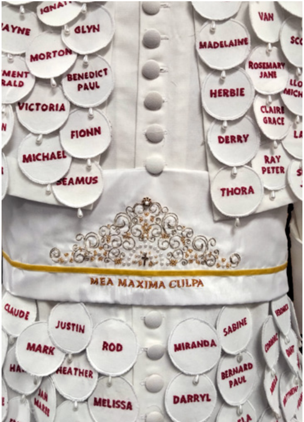
Figure 4. Kerry Martin, Wear the Weight of Their Stories (detail).