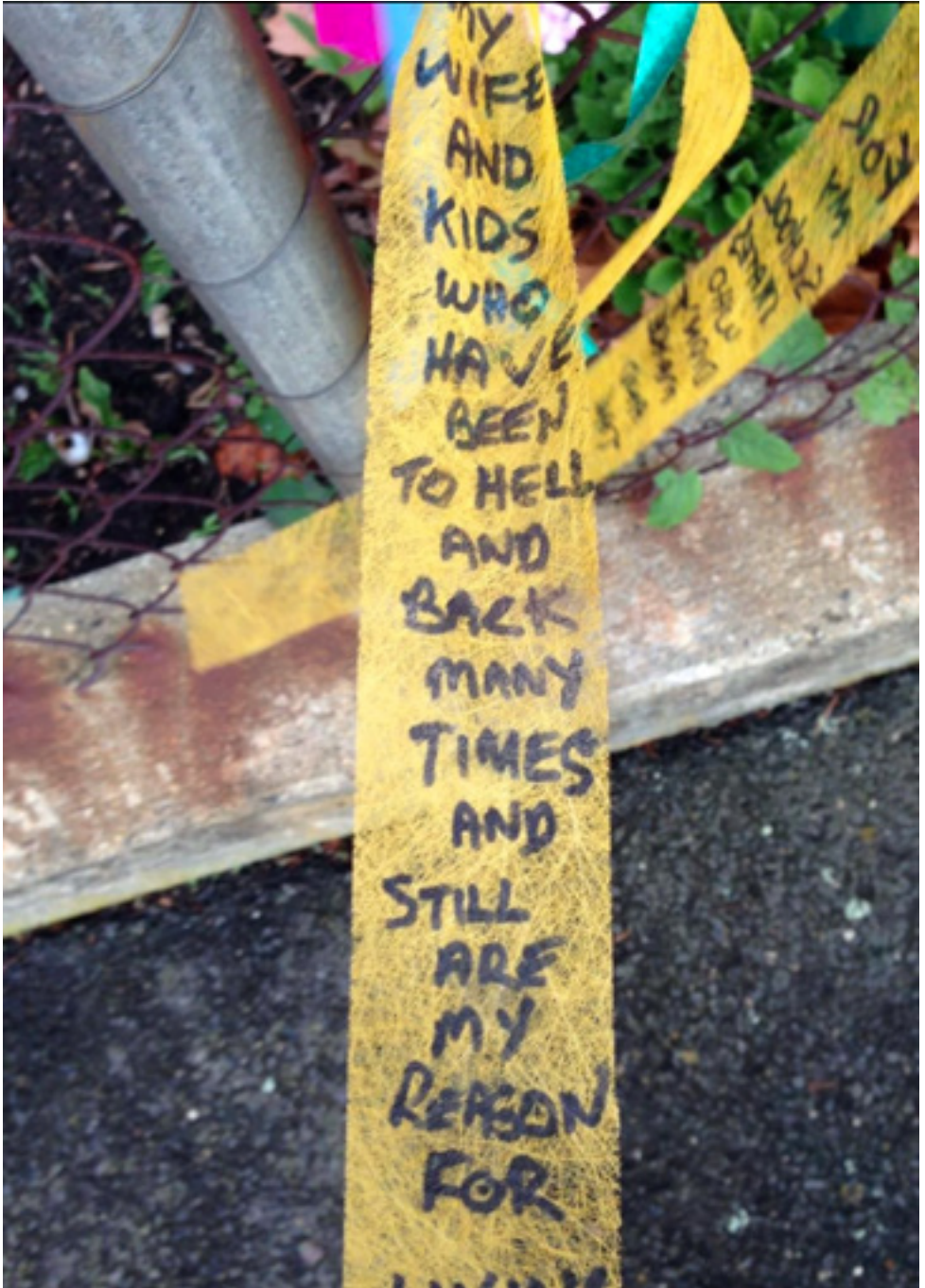
Figure 6. Handwritten text on a ribbon tied to a fence in Ballarat, Victoria.