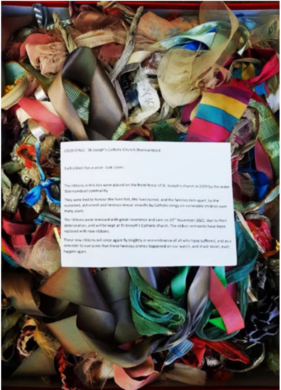
Figure 7. Ribbons removed from the front fence of St Joseph's Church Warrnambool, Victoria.