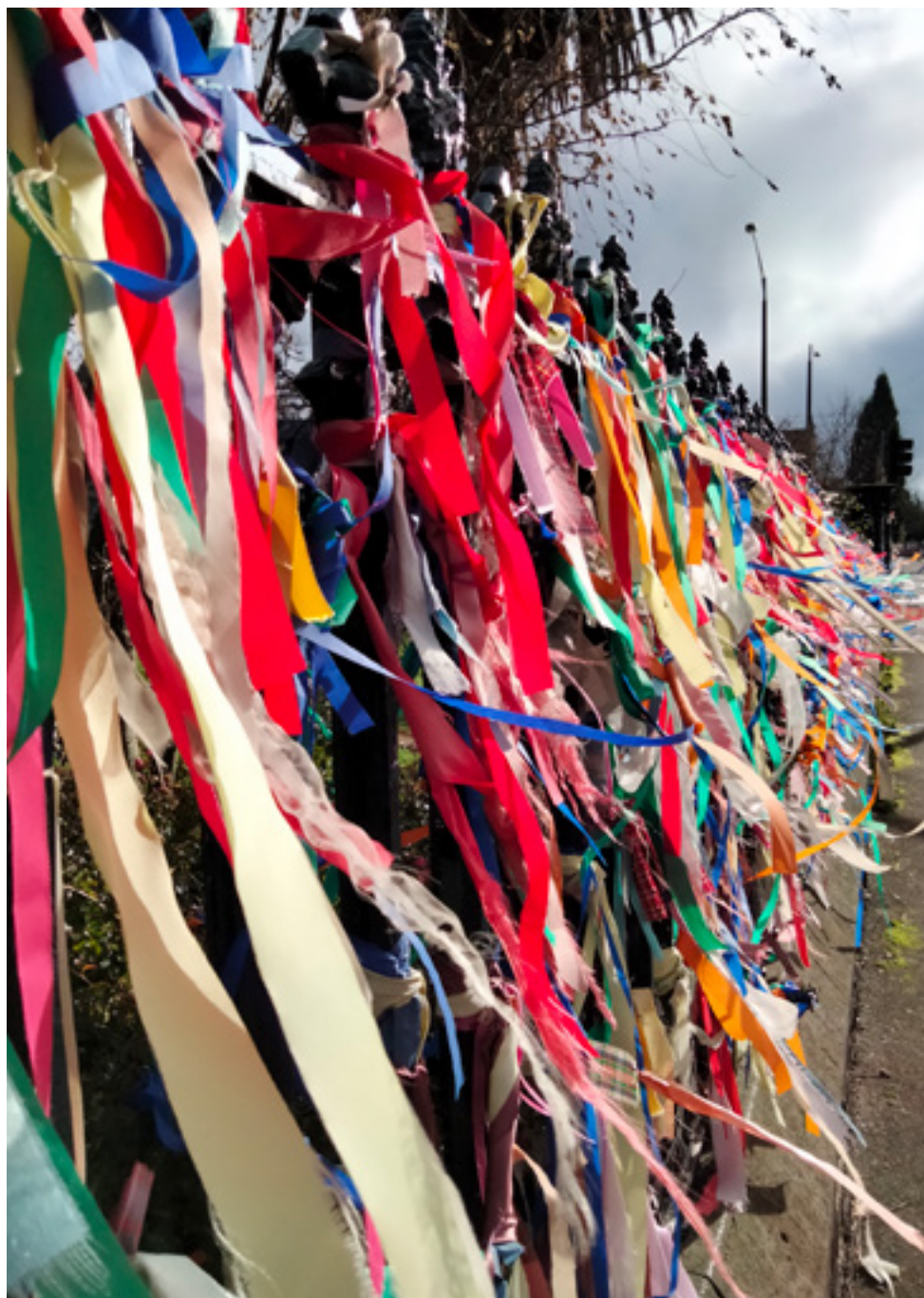
Figure 1. Close-up of ribbons tied to a church fence in Ballarat, Victoria.