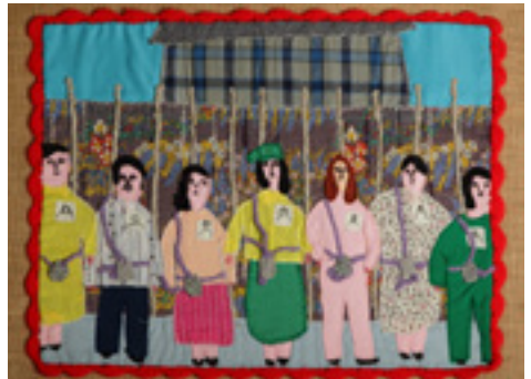
Figure 2. Encadenamiento / Women Chained to Parliament Gates. Chilean arpillera , Anonymous (c1988).

2017). Marjorie Agosín argues that arpilleras are anything but 'an innocent art' but rather 'an art denouncing' through a 'cloth of resistance' (Agosín, 2008, p.55). Likewise, others have spoken of the textiles as the production of the 'denunciatory' (Adams, 2000). In an exhibition at the Victoria and Albert (V&A) museum in 2014–2015, the arpilleras displayed, loaned by Conflict Textiles (discussed below), were described as 'disobedient objects' (Compton, 2014; Conflict Textiles, 2014) (see Figure 2, featuring women chaining themselves to the Parliament Gates in protest).