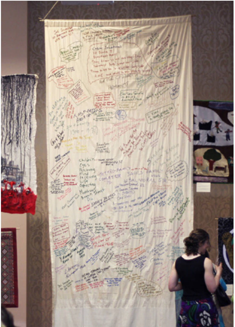
Figure 5. Exhibition 'Textile Accounts of Conflicts' as part of their International Conference 'Accounts of the Conflict: Digitally Archiving Stories for Peacebuilding', Hosted by INCORE (Ulster University).