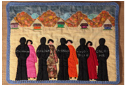
Figure 1. Cinco sitios de desaparición colectiva / Five sites of collective disappearance. Chilean arpillera , Irma Müller (1988). Photograph Martin Melaugh, © Conflict Textiles. Conflict Textiles Collection: https://cain.ulster.ac.uk/conflicttextiles/search-quilts2/fulltextiles1/?id=452

brutality of the repression' (Agosín, 2008, p56). The juxtaposition between the colourful materials and people, and sometimes cityscapes or countryside scenes, with political messaging and scenes of social injustice, is the hallmark of arpilleras . This is the essence of their power as an art form. Although the creation of dissonance between domesticity and the subject of war is not uncommon in textile work on conflict (Zeitlin