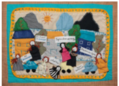
Figure 4. The word that caused the outbreak of war – 'Freedom' Syrian arpillera , Sabah Obido (2020). Photograph Martin Melaugh, © Conflict Textiles. Conflict Textiles Collection: https://cain.ulster.ac.uk/conflicttextiles/search-quilts2/fulltextiles1/?id=439

The Conflict Textiles physical and digital collection not only provides space for survivors of conflict to tell their stories through textiles at exhibitions and events but also allows users to learn more about conflicts transnationally in Chile, Northern Ireland, and many other countries. Conflict Textiles is proactive in its outreach and engagement. It stimulates and motivates academics, museums, textile artists, activists and civil society organisations to become involved with arpilleras and use the collection for comparative research and educational purposes.